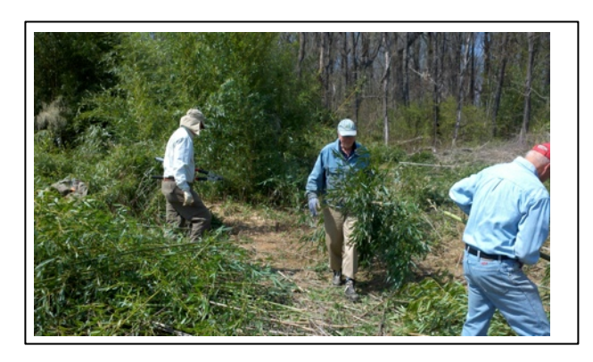
Members tackle invasive bamboo on Volunteer Day at Blue Ridge Regional Park