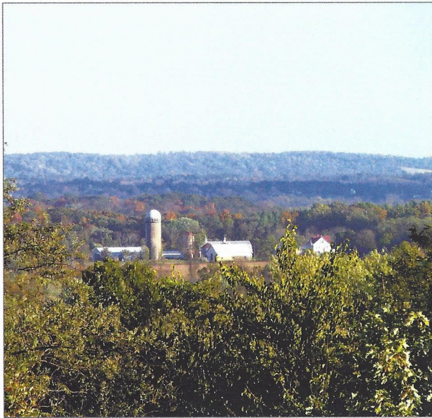
Many large tracts of land within the study area are unprotected - leaving Bluemont vulnerable to loss of natural, historic, and cultural resources.

THE LAND TRUST OF VIRGINIA invites you to attend