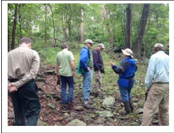
Participants assess the situation on Volunteer Day at Blue Ridge Regional Regional Park