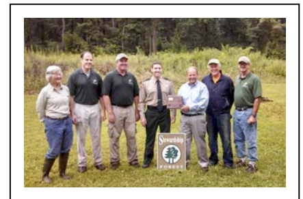
The Northern Virginia Regional Park Authority accepts the Forest Stewardship Award