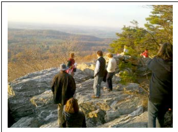
View from Bears Den – a nature hike prior to the Annual Meeting