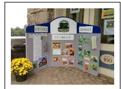
Ready for the fair...with a display of our work