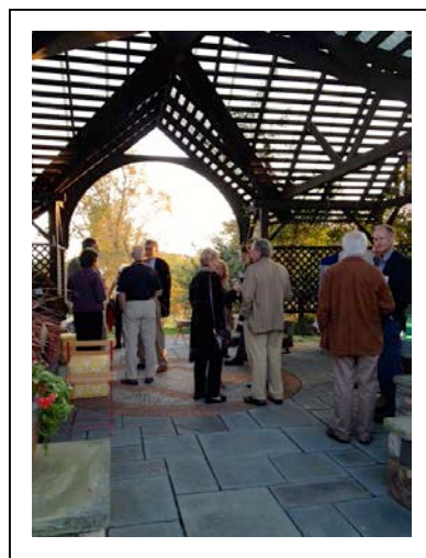
Fundraising event for conservation summit